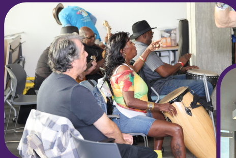
Participants singing along at Neighborhood Sing Joshua House

Neighborhood Sing, our flagship program, is a music workshop consisting of singing and mindfulness activities led by music professionals. In 2024, we brought weekly programs to Los Angeles Christian Health Centers' Joshua House Clinic and Los Angeles Public Library's Central Library.