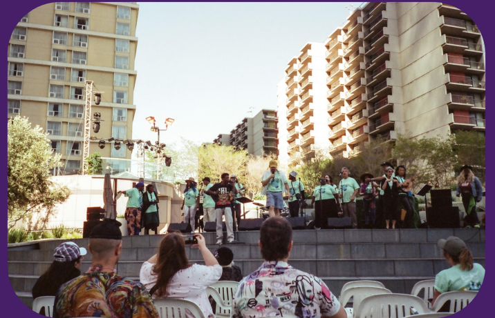
Musicians, volunteers, and community members join together from all pop-up stages for the Event Finale at the California Plaza with Grand Performances to cap off the day.

On Sunday, April 28, Skid Row and UVP artists and community members joined partners including Grand Performances, Skid Row Museum, Gay Men's Chorus of Los Angeles, and Angel City Chorale for our third annual C'mon, Sing! Festival. We transformed Downtown LA into a vibrant musical celebration, uniting housed and unhoused communities through the power of song. Stages were set with bands, singers, songleaders, and volunteers on 5th & San Pedro in Skid Row, Historic Downtown Farmers' Market, Japanese Village Plaza in Little Tokyo, La Plaza in El Pueblo de Los Angeles, and Grand Performances at California Plaza in Bunker Hill. At each site, artists and volunteers invited community members and passersby to sing along and share in open mic performances.