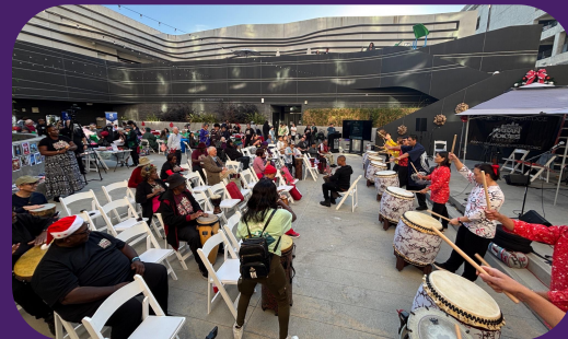
East LA Taiko Productions lead drumming workshop