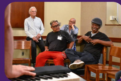
Participants sharing out at Central Library