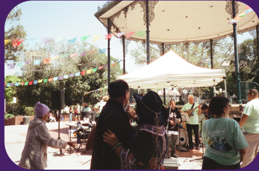
Musicians and community members join together at UVP's pop-up stage on 5th & San Pedro in Skid Row.