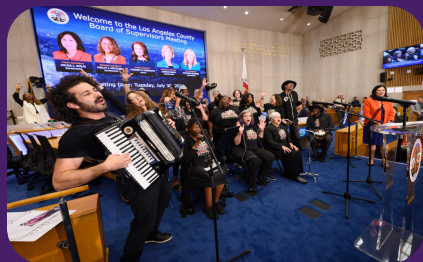
LA County Board of Supervisors Meeting

2024 has been a huge year for UVP's Performance Ensemble. We performed at the HLTH Conference in Las Vegas and returned to out-of-state concerts with a program at Congregation Ner-Tamid in Henderson. The Choir had the honor of being invited by Hilda Solis to sing out at the LA County Board of Supervisors meeting in July, performed at the Grand Ave Arts: All Access Festival, and at the Harbor Connects Day of Thanks Celebration!