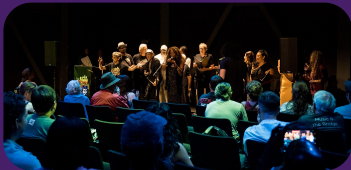
UVP Performance Choir performs together to close the event.

Coffeehouse 2024 was held at Inner City Arts' Rosenthal Theatre. Nineteen UVP choir members and program participants each performed songs that highlighted their singular voices. Eight weeks of coaching with four teaching arts preceded the event. Lessons took place at our partner sites Studio 526 and Creating Justice LA.