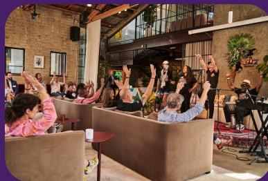
Conspiracy of Love Conference