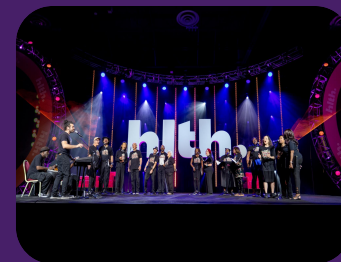
HLTH Conference in Las Vegas