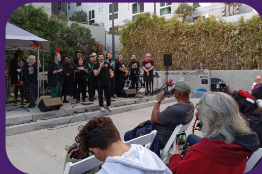
UVP Performance Ensemble closes the event