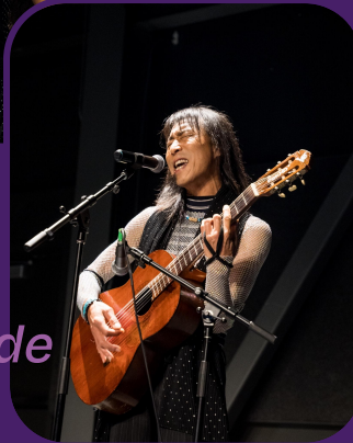
PB K Ande