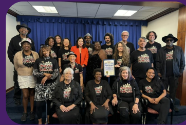
UVP Choir with Supervisor Hilda Solis