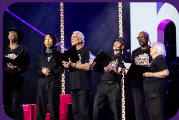
UVP Choir performing at HLTH Conference in Las Vegas