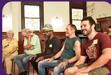
Rehearsing at the UVP Choir Retreat at The Pico Union Project