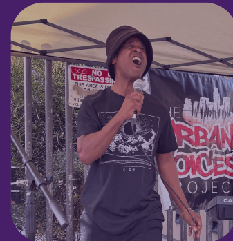
UVP Participant Buskfest Open Mic